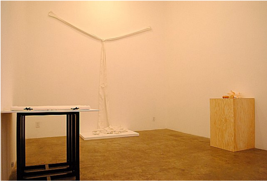
Claire Nereim: Gallery View